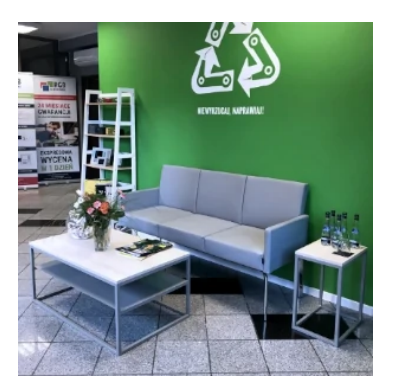
COOPERATION WITH RGB ELECTRONICS IS: